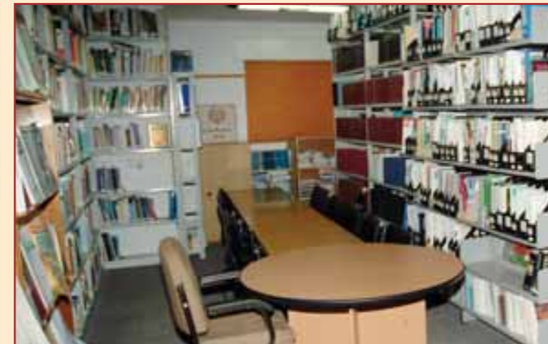
MA'AN Resource Center

MA'AN's library is equipped with thousands of books, journals, magazines, articles and documents in both Arabic and English. Publications specialize in the fields of development, agriculture, permaculture, training and management. There are also hundreds of training manuals and video and audio tapes. This resource unit is open to the public and is connected to the Internet for access through MA'AN's Website.