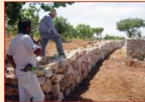
Restoring agricultural land through the construction of stone terraces in Beit Jala

Since its establishment in 1989, MA'AN has strived to improve Palestinian communities, particularly focusing on the marginalized and poor sectors of Gaza and the West Bank. For MA'AN the development of Palestinian human resources is at the core of sustainable development, which places the needs of the individual and the community at the heart of the developmental process.