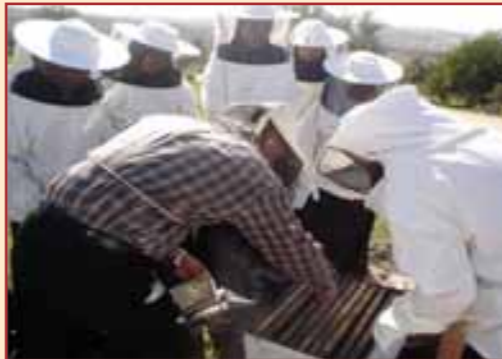
Training in Apiculture (beekeeping) in Bil'in, Ramallah district