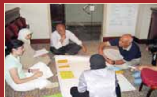
Training in Project Cycle Management

MA'AN's 37-member General Assembly governs the center's policies and strategies. It elects 7 members every 2 years to serve as a policy board that implements and monitors these strategies. It also assigns and assesses a director general, who manages the center with the assistance of a team of specialized and skilled professionals.