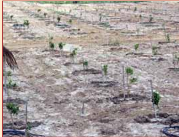
Land Reclamation project in Qarara, Gaza Strip